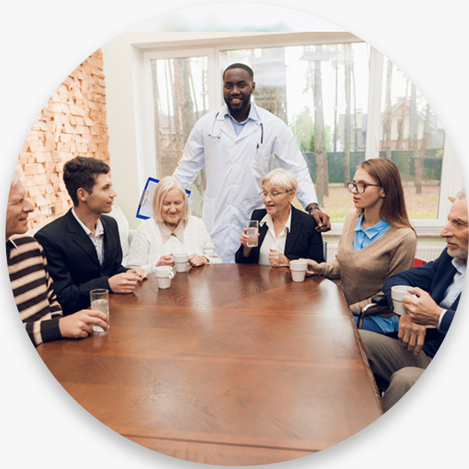
“Personal Patient Caregiving Team/Squad”

AGE All Ages JOB TITLE All STATUS All LOCATION Anytown, USA